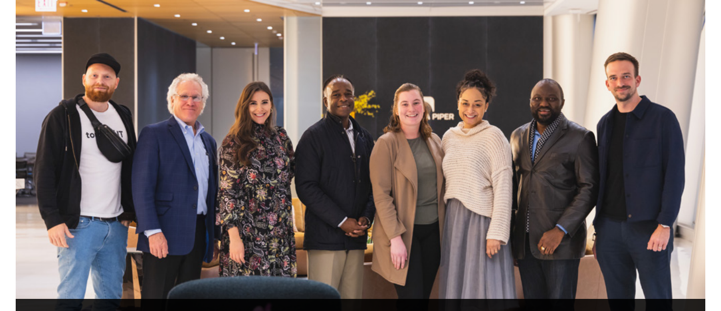
In Chicago with our partners from Big Heart, Big Heart Philanthropy, and MyOwnDoctor. Together we have been digitalizing American healthcare for four years now.

relationships, shared values. The time zone is extremely important. I'm very glad that we managed to build it without our physical presence until now; it's certainly also about luck. Because we come across companies that started cooperation, everything went fine, but the time difference was an issue for them and they backed out. The East Coast is better for us, the meetings with them start at three or four, so we have about 2-3 hours of working time overlap with them. Once it's the West Coast, it's more challenging. You need to be prepared in advance for this.